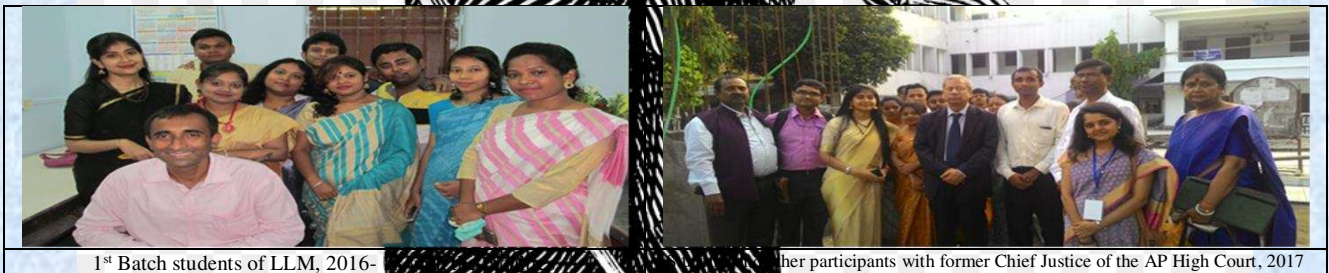
1 st Batch students of LLM, 2016-