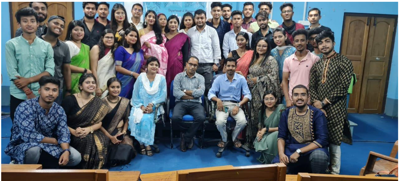
Department of Business Administration Farewell 2022 ( UG & PG Final Year)