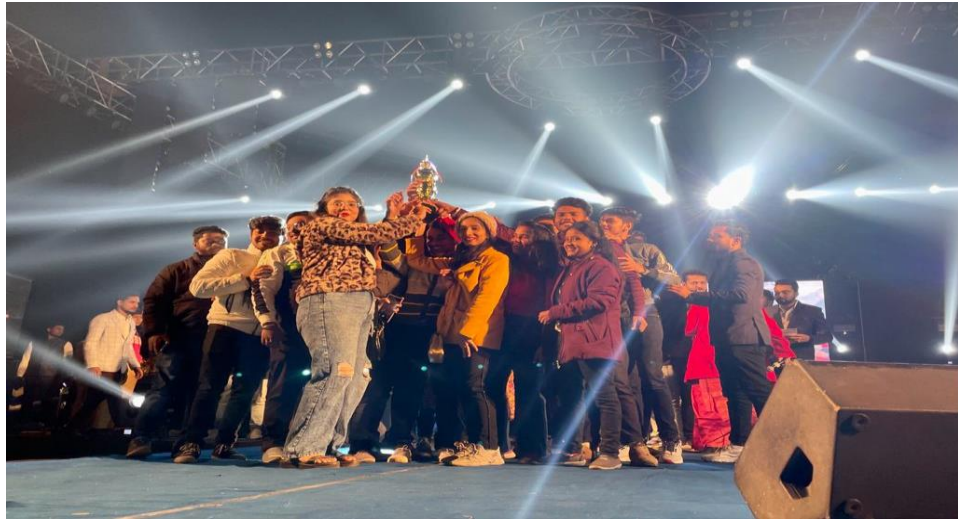
2 nd Prize in Exhibition ( Raivarsi Fest in 2023)